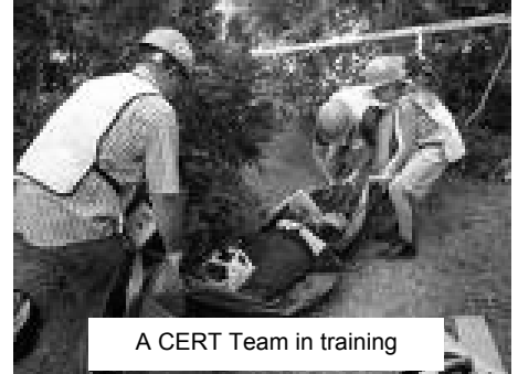
A CERT Team in training

That event was soon followed by a quake in Humboldt County the same month. The Grange surely shook, but the biggest impact was the loss of electric power 1/2 hours before a fundraiser by the Eureka Sisters. We would like to fund a backup generator tied to the main panel to restore heat lights and power to the sewer sump pump. Many other earthquakes, floods, fires and road closures (including HWY 96) have led to interest in a local Community Emergency Response Team.